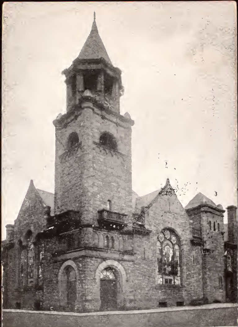
234. Second Methodist Church, Altoona, Pa.